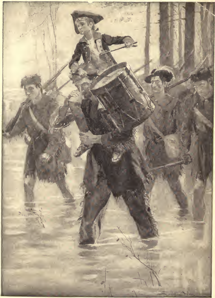
“ BEATING THE CHARGE WITH ALL MY MIGHT.”